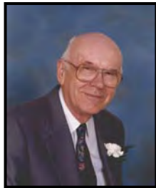
March 6, 1920 – August 30, 2009